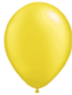
Pearl Citrine Yellow