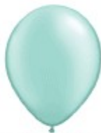
Pearl Mint Green