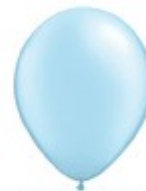
Pearl Light Blue