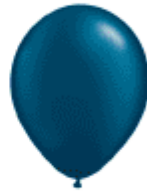
Pearl Midnight Blue