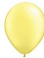
Pearl Lemon Chiffon