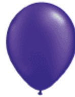
Pearl Quartz Purple