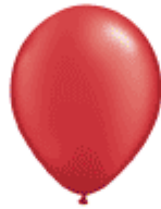
Pearl Ruby Red